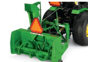
Add more capability. SB1148 Rear mount snow blower