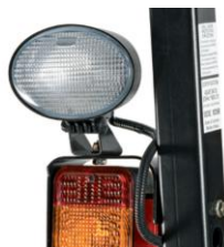
Add more hours. LVB25546 Fwd. lighting kit (2 lights)

Whether it's enhanced productivity, stability, visibility, or hours in the field, these attachments will help you get the most out of your John Deere Tractor.