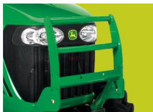
Add more protection. BW16040 Hood Guard