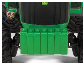
Add more stability. LVB19607 Front weight bracket