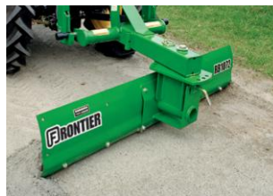
Add more versatility. RB5072 Rear blade