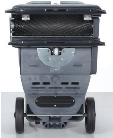
Dual squeegee system and cylinder brush for cleaning all hard floors.