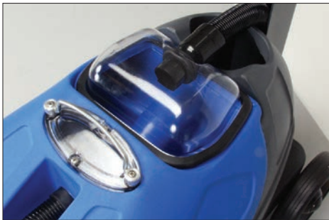
Clear lid for monitoring of recovery.