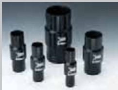
Hose Swivels 2-6" Available