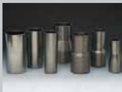
Steel Hose Connectors & Reducers