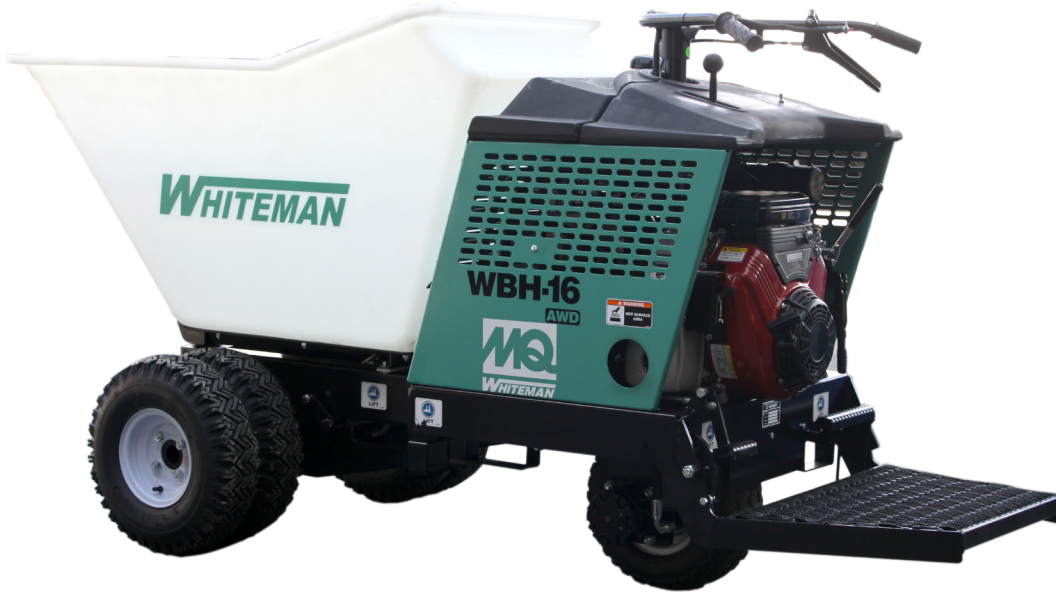
Model WBH16EAWD Features electric start Vanguard engine